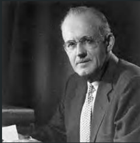
Arthur W. Pink

“That God is great in wisdom, wondrous in power, yet full of mercy is assumed by many as common knowledge. But to entertain anything approaching an adequate conception of His being, nature, and attributes, as revealed in the Scripture, is something which very few people in these degenerate times have done.”